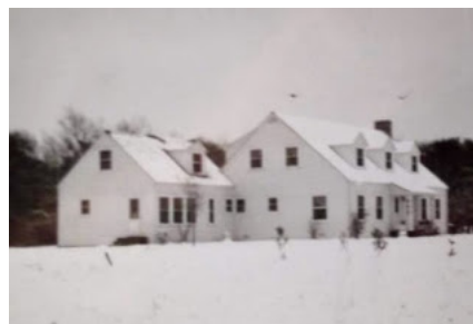
Original Emmott House in the Snow, 1939