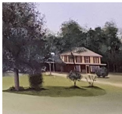
Painting of JHE's Original House in Emmottville

Soon after Grandmother's dream house was built in 1937, oil was discovered in Emmottville. Oil made possible a one-acre pond to be filled with crystal clear blue water from White Oak Bayou, bountiful perch, catfish, and bass. Oil allowed Paw Paw to retire at age 50 and tend to me, to kids and grandkids, like he cared for his garden of vegetables, corn, watermelon, strawberry plants, tomatoes, potatoes, carrots and okra. Oil provided the excitement of watching five producing wells being drilled, creating slush pits ripe with frogs to catch and eat. And, oil brought to Emmottville Mr. Rodgers. He was Amerada Hess's oil superintendent, a de facto uncle to me and all my cousins.