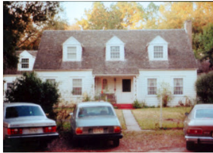
Original Emmott House Today